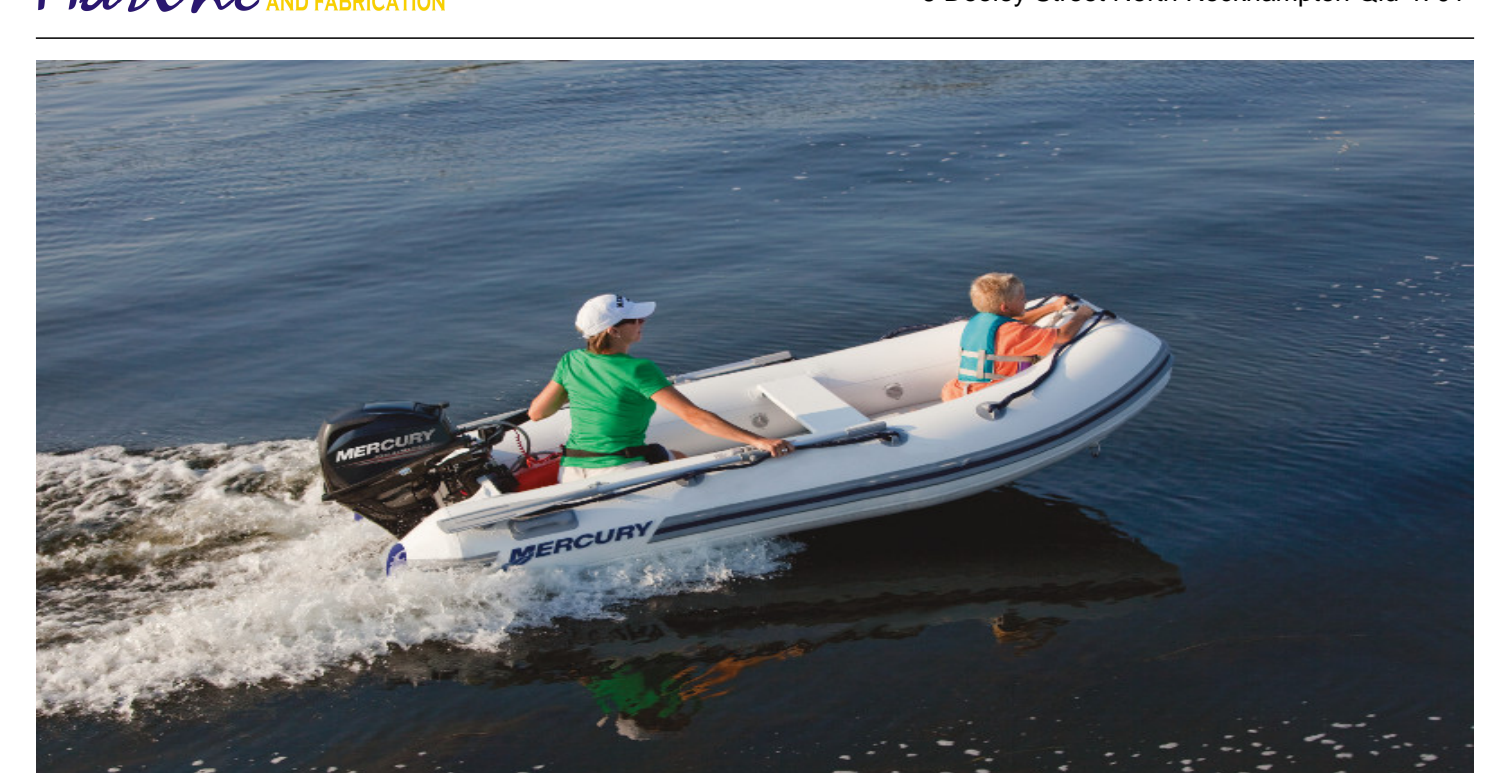
Mercury 320 Air Deck POA