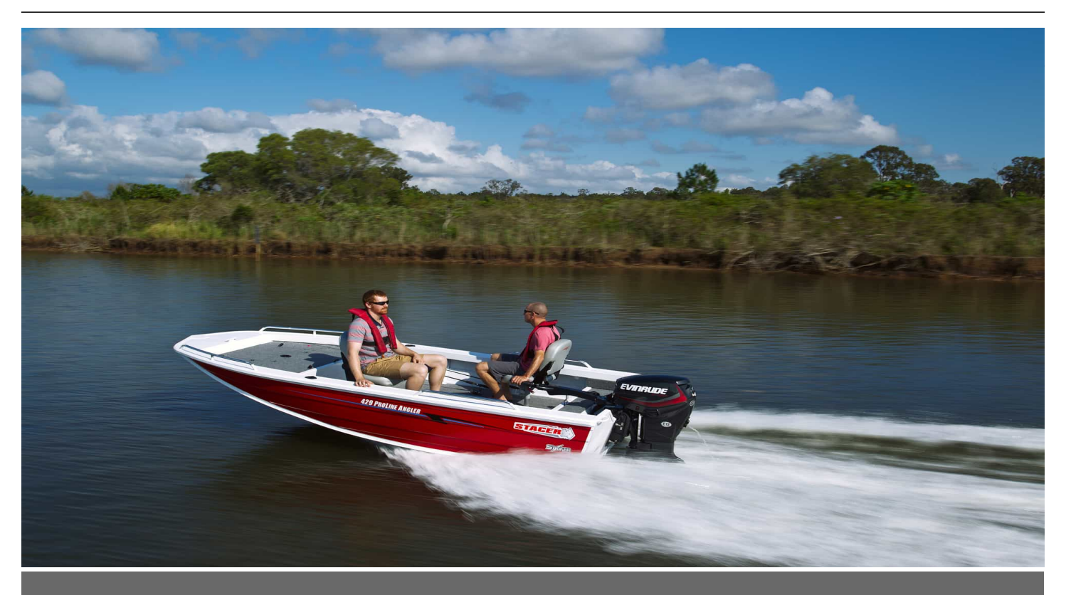
Stacer 429 Proline Angler POA